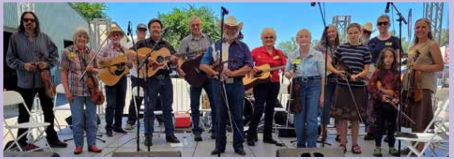
District 4 at the 2023 Josephine County Fair