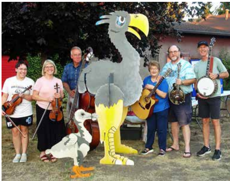
District 10 members at the Vaux's Swift Watch event (hosted by Umpqua Valley Audubon Society) near The Clay Place chimney where about 2000 birds roost each evening in September

A Joint Potluck & Jam is planned with District 4 at Azalea Grange Hall (142 Pisqually Lane) on Saturday October 21. OOTFA is partnering with Azalea Grange #786, as well as local musicians in that area who will join us at the potluck/jam from 3 - 6 pm. Potluck at 3 pm, with Jam to follow