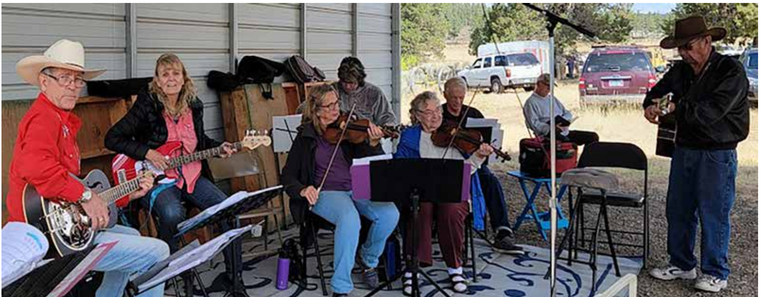
OOTFA musicians playing at the Hildebrand Threshing Bee