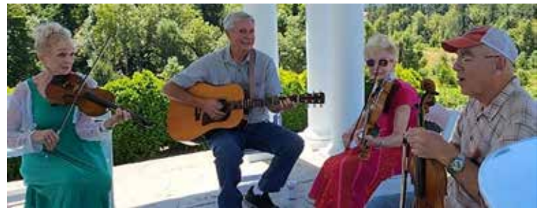
District 7 musicians at Oswego Hills Winery