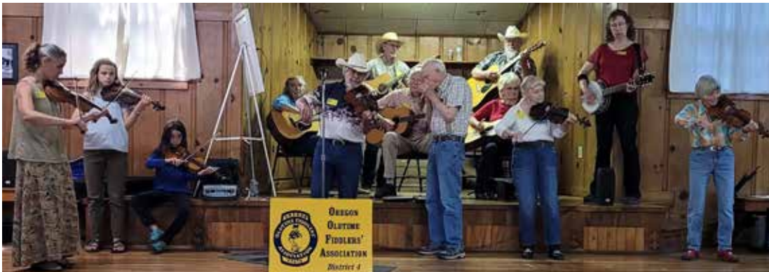
District 4 musicians performed for the Prospect Community Center BBQ

District 4 musicians performed for the Prospect Community Center BBQ . The food was delicious and the audience quite welcoming. Eight couples (and one confused dog) danced the "Virginia Reel" energetically and at the close of the jam the musicians had them marching to the "St. Timothy's March". It was for all a fun afternoon.