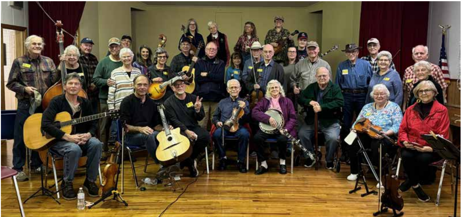
A nice District 6 turnout for the Thanksgiving meal and jam at Central Grange on November 11th