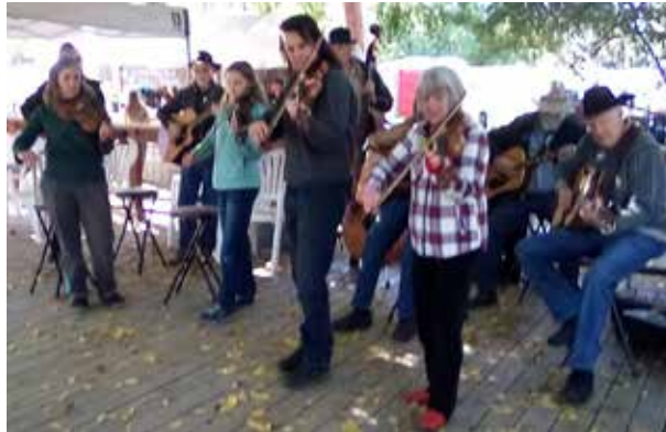
District 4 musicians playing for families at Pheasant Fields Farm