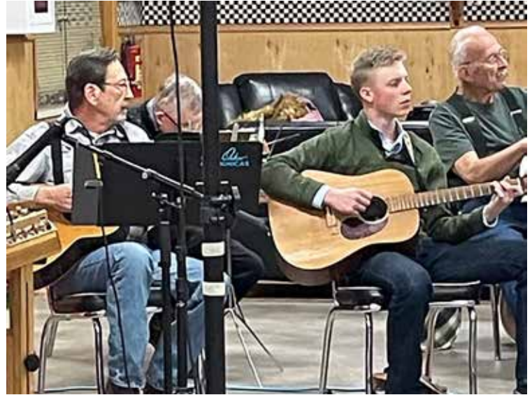
District 9 jammin' at The Hub