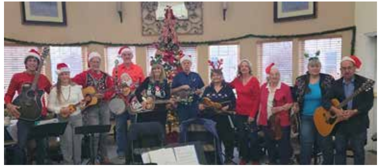
District 1 at Pelican Pointe Care Center