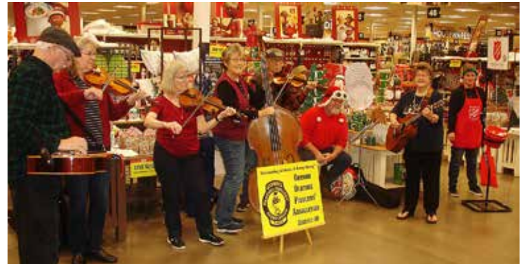
District 10 appeared with the Salvation Army Bell Ringers