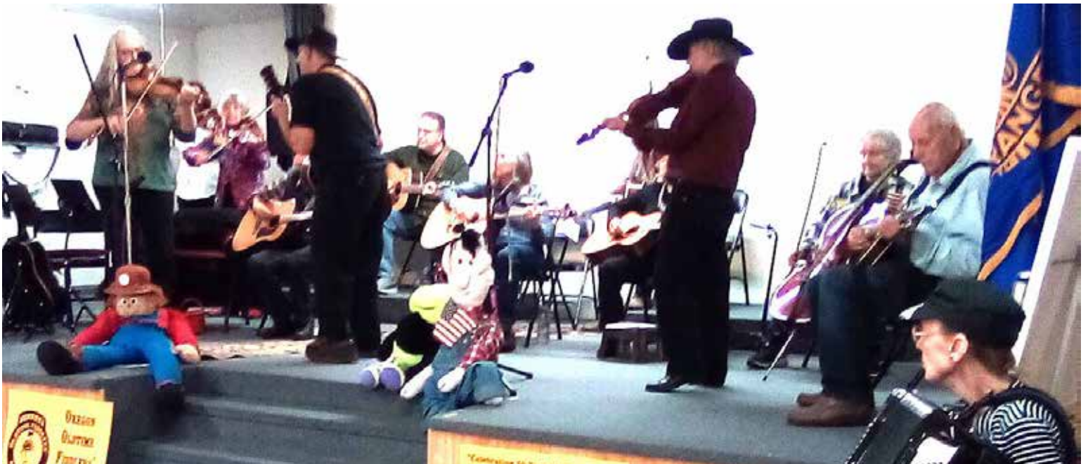
District 4 musicians on stage at the Fruitdale Grange for the January jam.