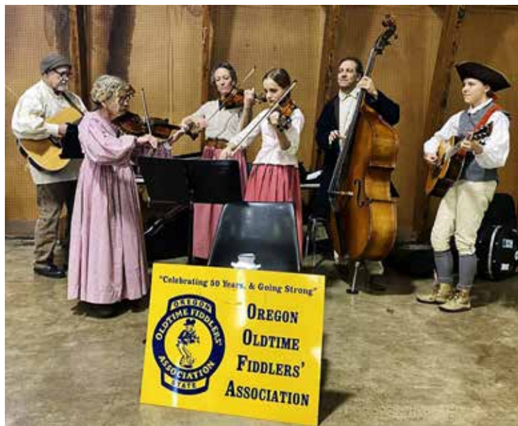
District 6 at the Frontier Heritage Fair

muzzle loading, trapping, wood and metal working, bead-working and crafting. The Fair offers something for everyone, even lovers of old time music.