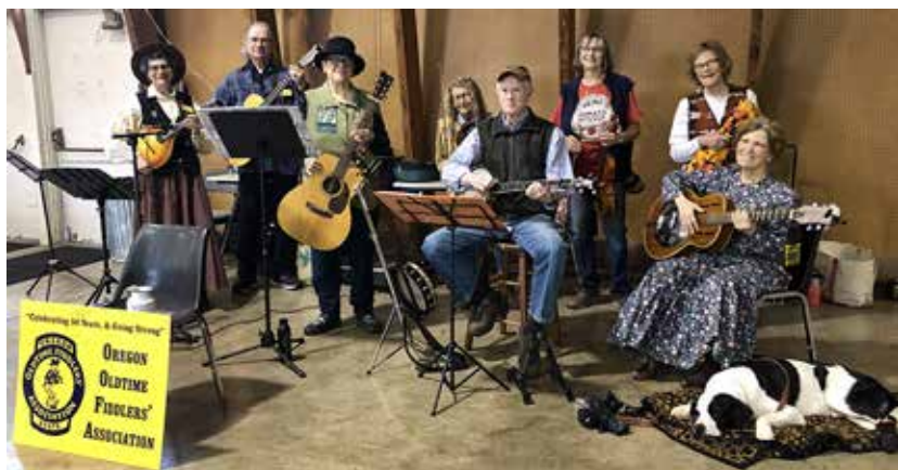
District 6 at the Frontier Heritage Fair

The annual Frontier Heritage Fair , held in February at Eugene's Lane County Events Center , offers an opportunity for visitors to step through a time-travel portal to the 1800's, where they'll mix and mingle with, and learn from, traders, vendors, reenactors and exhibitors of period artifacts and replicas, including spinning, weaving and quilting,