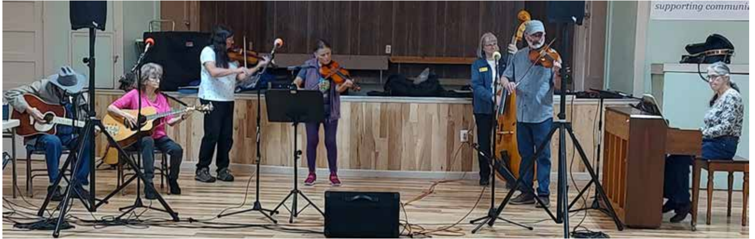
District 3 perform at the Terrabonne Grange each month