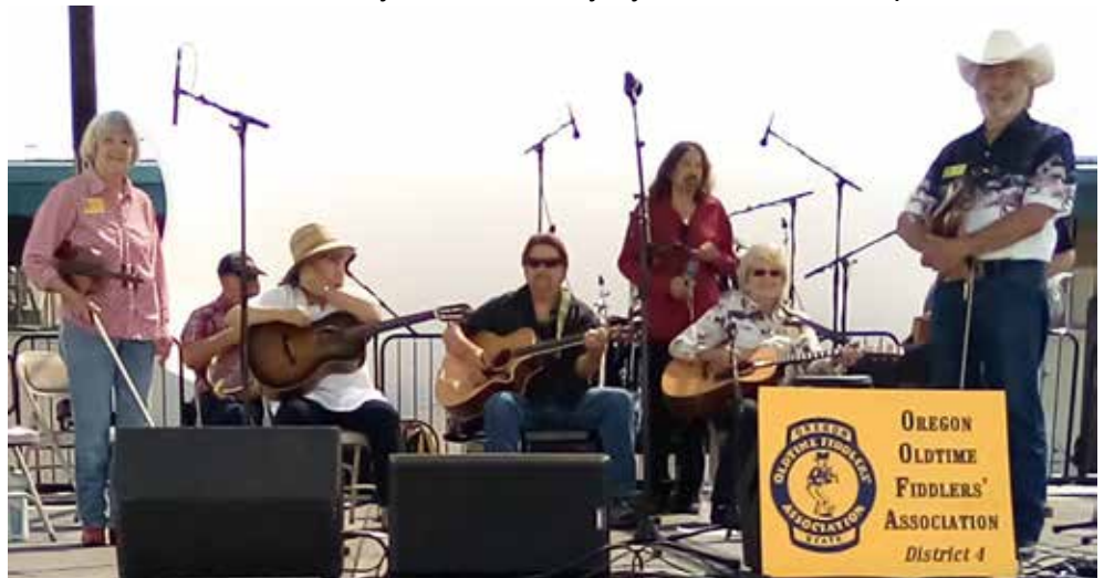
District 4 musicians played for the Josephine & Jackson County Fairs