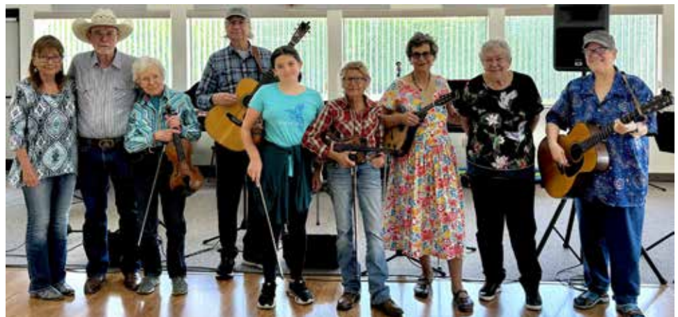
District 6 performed for a dance at the Lakeridge Community Center