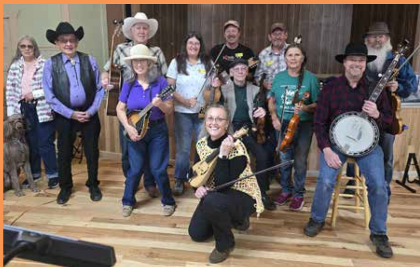
Event hosts, District 6