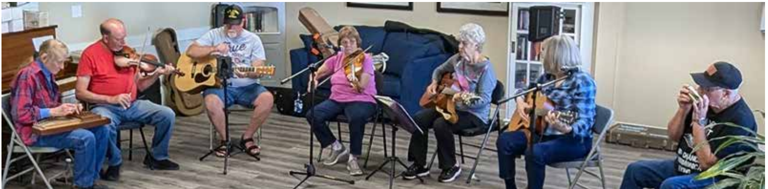
District 5 playing at Bandon's Pacific View Care Center, one of our favorite performance venues