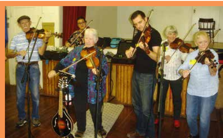
OOTFA Districts 4 & 10 got together for a joint potluck and jam