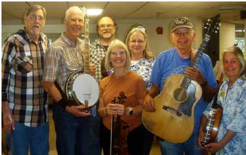
District 10 at Garden Valley Retirement Center