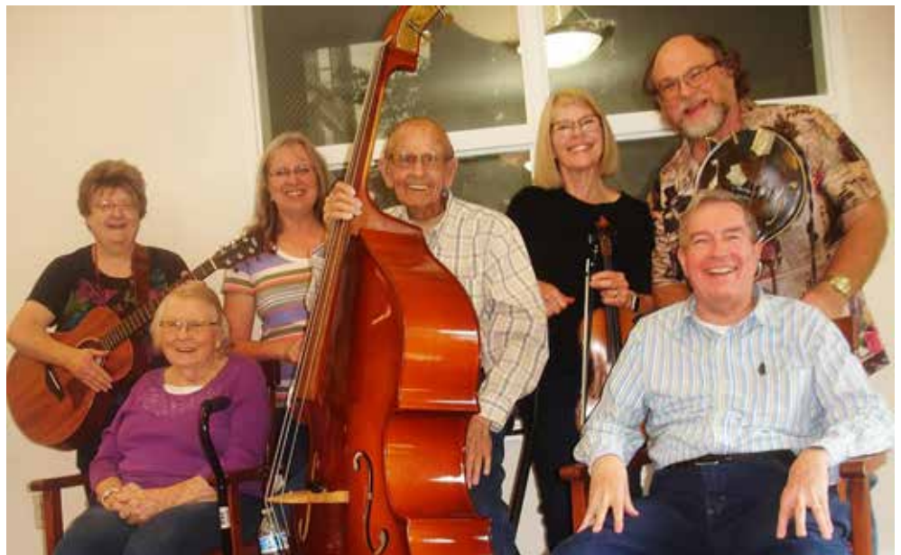
Each month District 10 members entertain at a variety of retirement communities