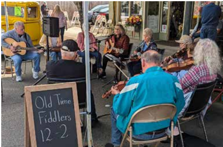
Pleasing the crowd at the Harvest Festival in Myrtle Point