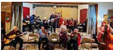
Musicians at 2024 Eagle Creek Sweetheart Dinner