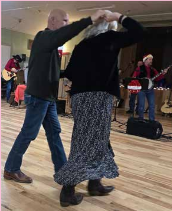
District 3 musicians know how to get 'em out on the dance floor