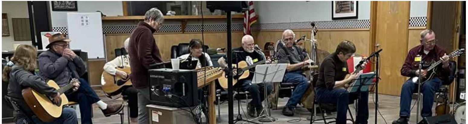
District 9 is in the planning stages for the High Desert Jamboree, June 12-14