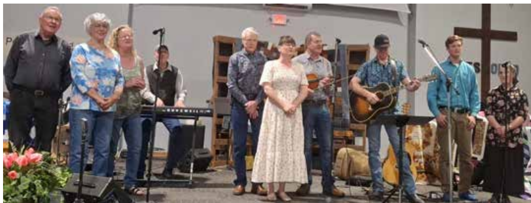
The Boohar Family entertained at the Spring Convention