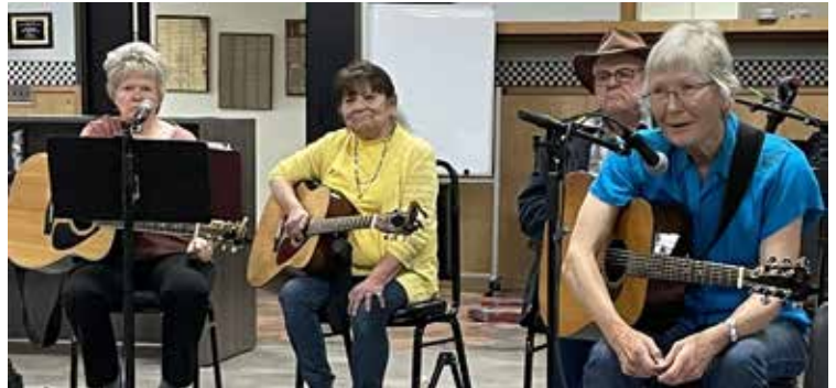
District 9 members between tunes

April 13th was our monthly potluck and open jam at Harney Hub Senior Center . A busy day as they are open all days now as a resource place for flood victims. Food boxes and cleaning kits are dispensed, and a Red Cross team is set up to aid folks to find all help available. Good food and visiting. Listeners and clappers out-numbered musicians with a great afternoon of music.