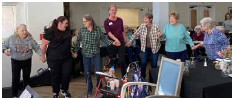
Residents of Rogue River Place dancing to "You Are My Sunshine"