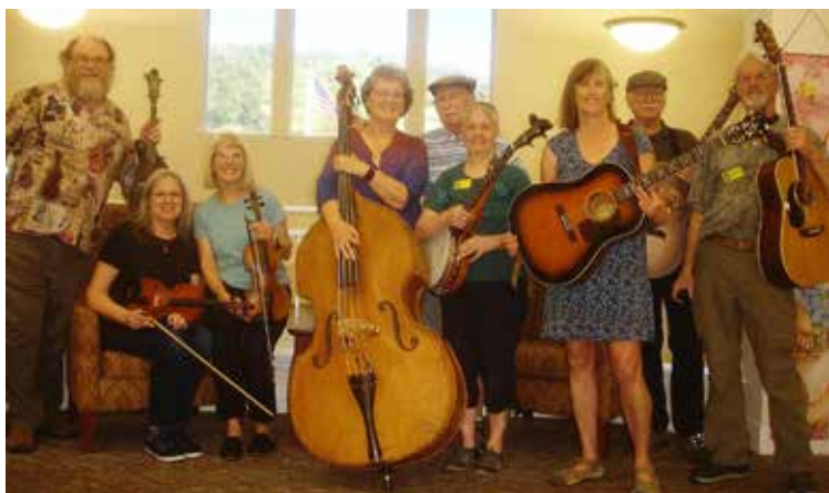
District 10 at Callahan Village