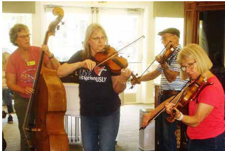
District 10 entertains at Brookdale