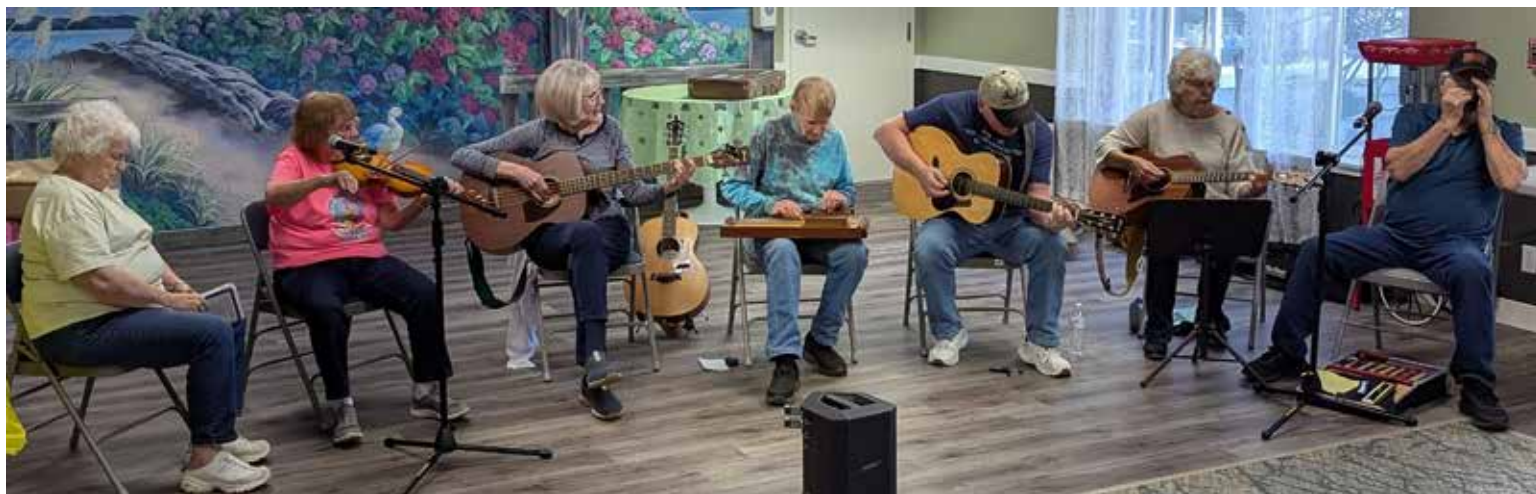
District 5 entertains the residents at Pacific View