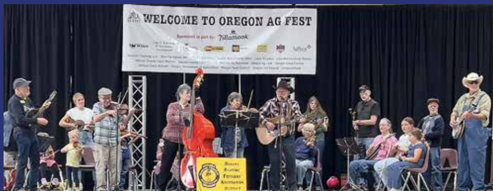
District 8 Musicians take the stage at AG Fest