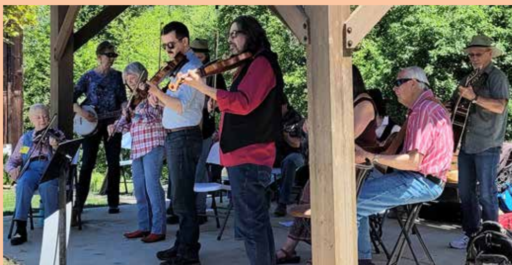
District 4 plays Heritage Day at the Butte Creek Mill in Eagle Point