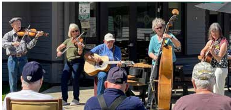
District 10 at the Roseburg Veterans Health Care System's Lodge