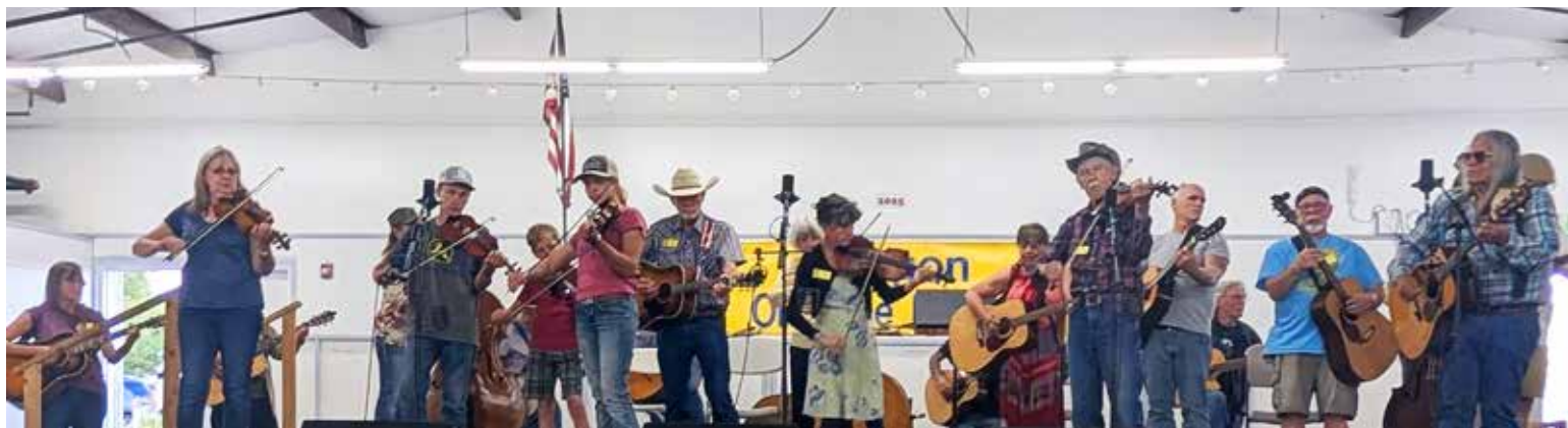
OOTFA members from around the state joined together at the High Desert Music Jamboree