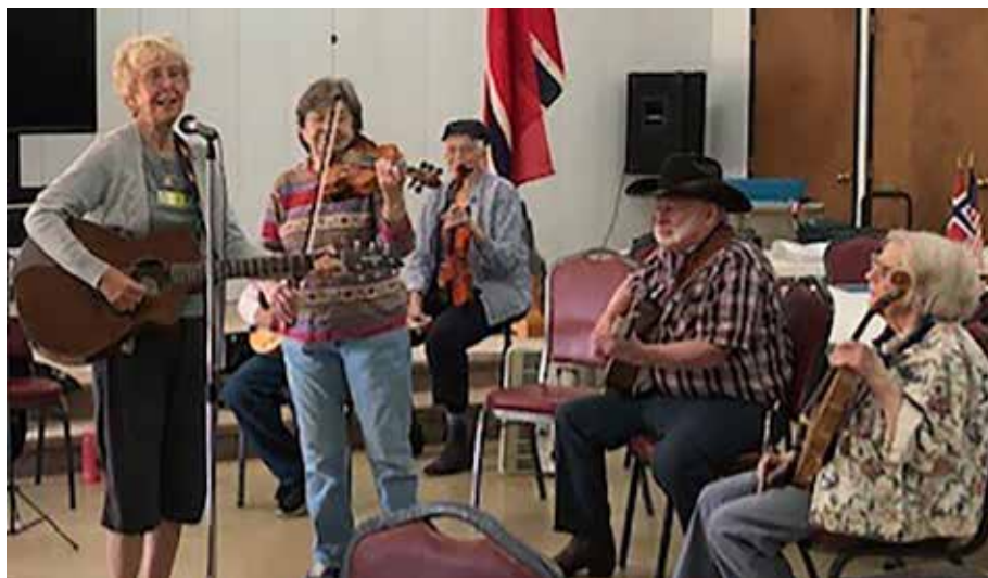
District 8 at the Sons of Norway