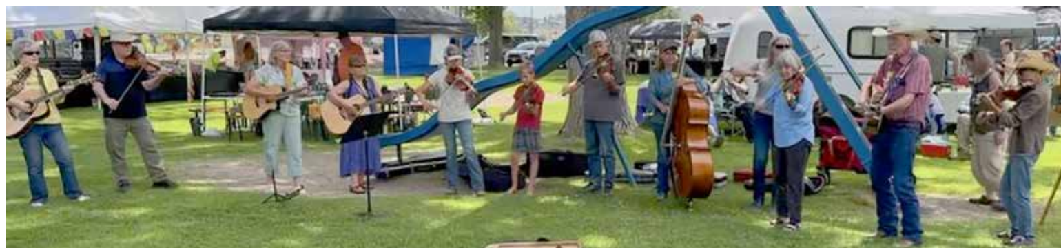
Musicians attending the Jamboree took a little side trip to Hines and made some music at Obsidian Days