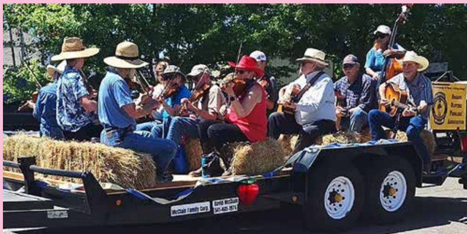
OOTFA on parade, downtown Weiser