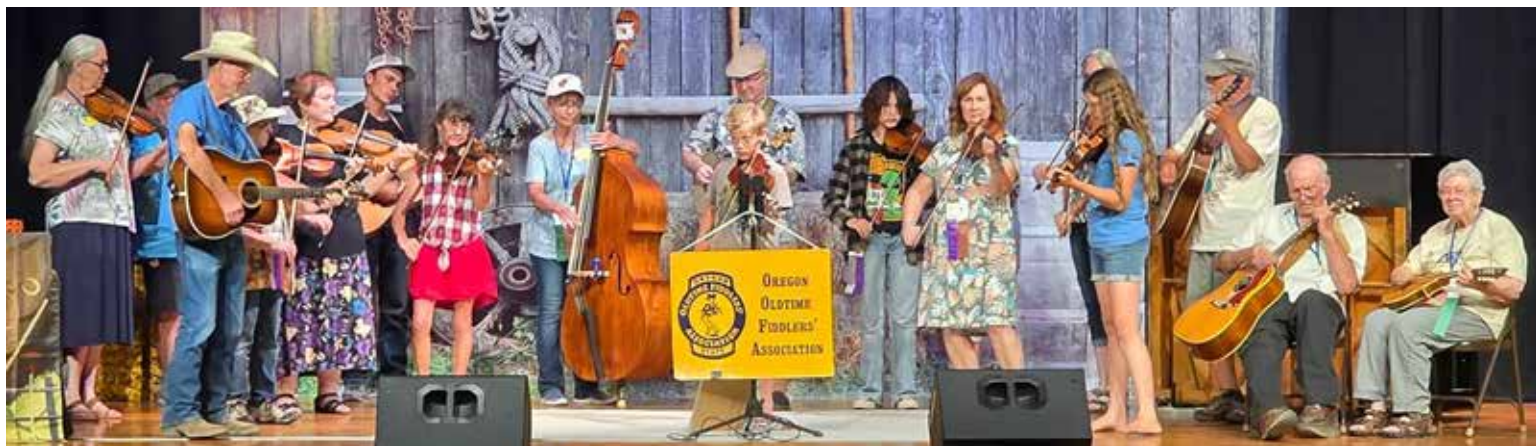
The Oregon Oldtime Fiddlers' Association was the host state at the National Fiddle Contest in Weiser, Idaho