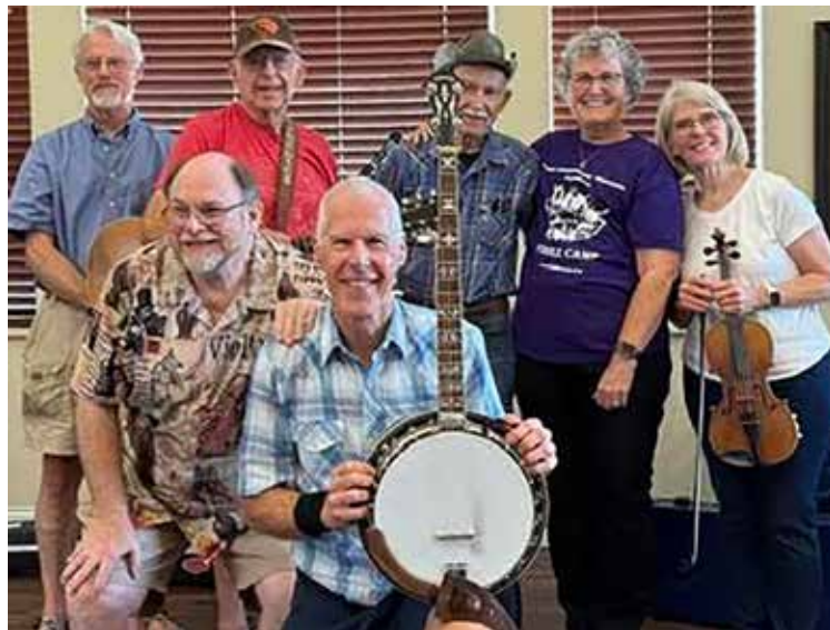
...at Bridgewood Rivers