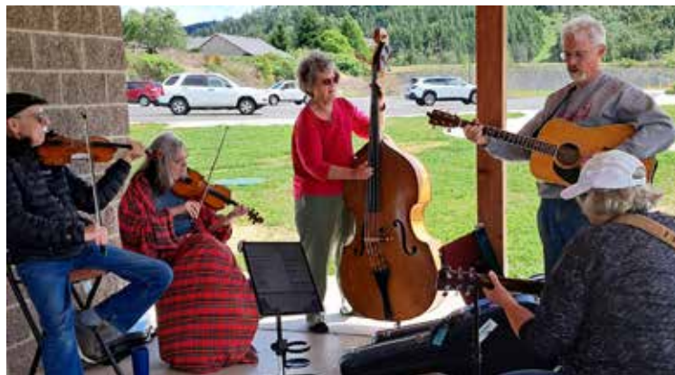
...and at Ford's Pond