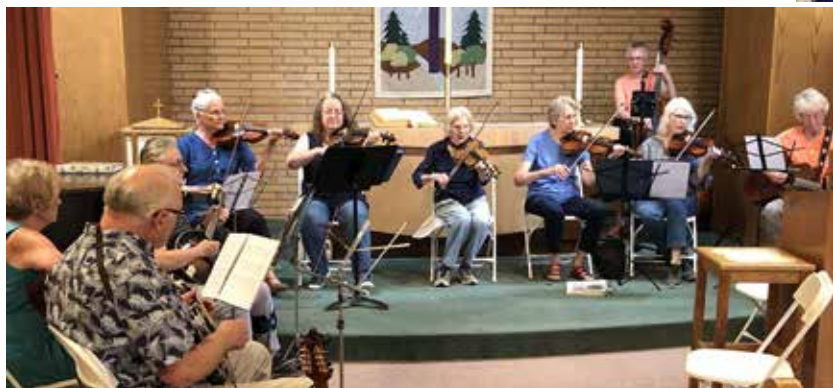
Monthly Jam at Willamette Lutheran