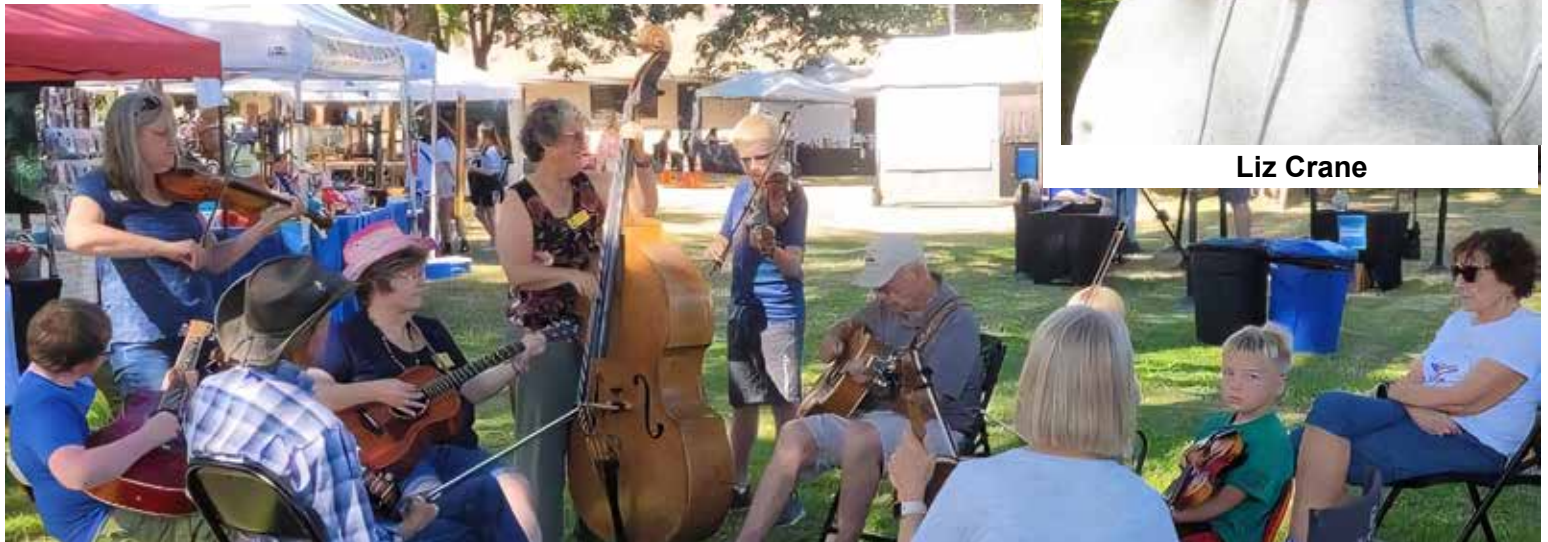
District 10 enjoying a beautiful summer day at the Umpqua Valley Summer Arts Festival