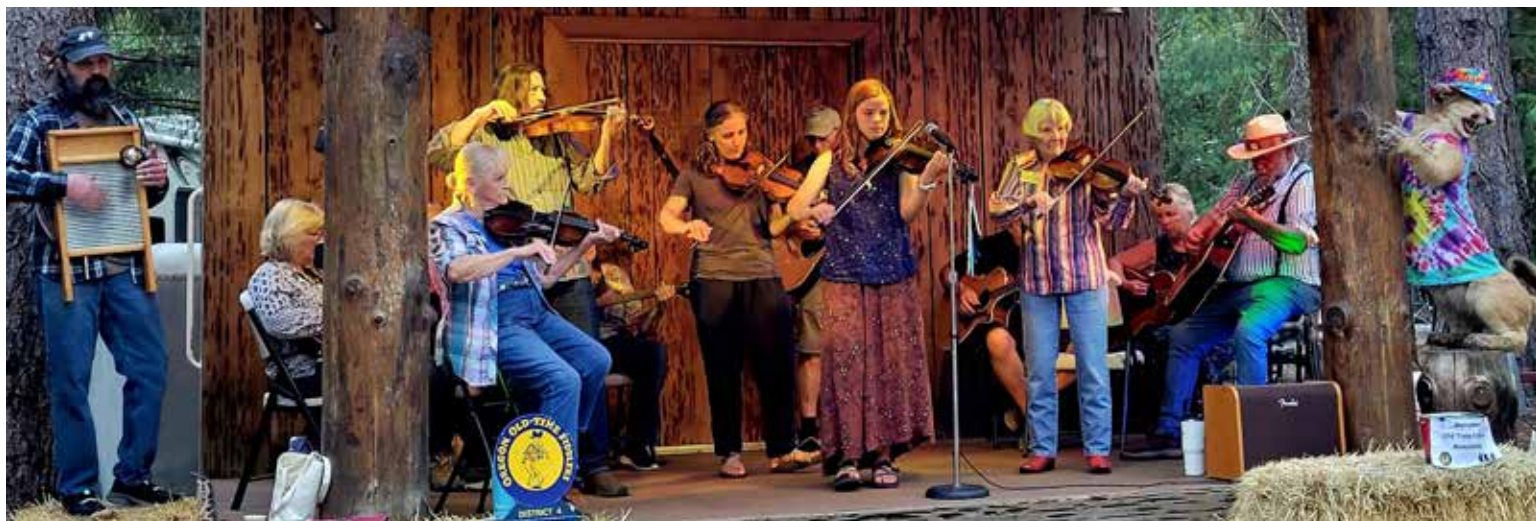
District 4 performing at the RV Park in the mountains