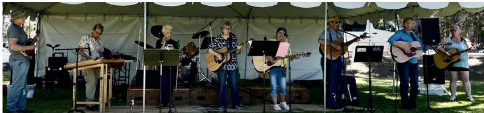
District 9 at the Archeology Roadshow in Hines City Park, June 28