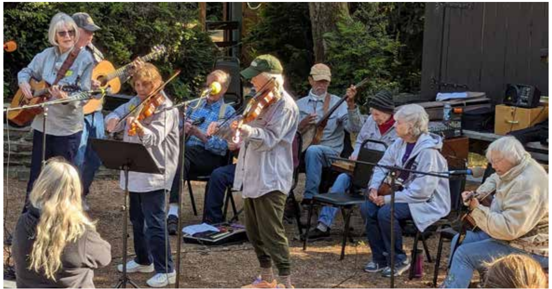
District 5 at Bullards Beach