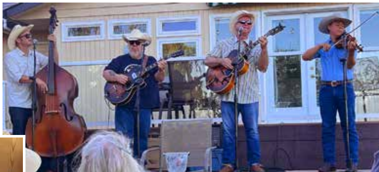
The Western Flyers