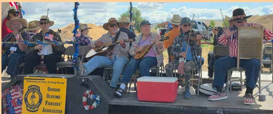
OOTFA in the Fiddle Parade on Main Street, Weiser on June 21