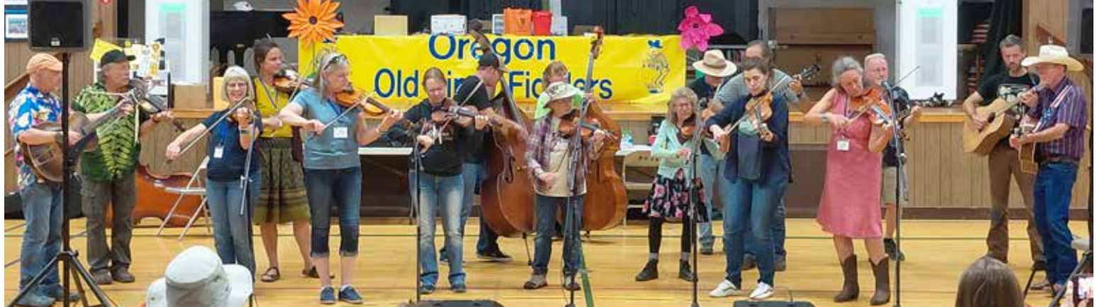
2025 West Cascades Fiddle Camp instructors are a fine collection of talented musicians