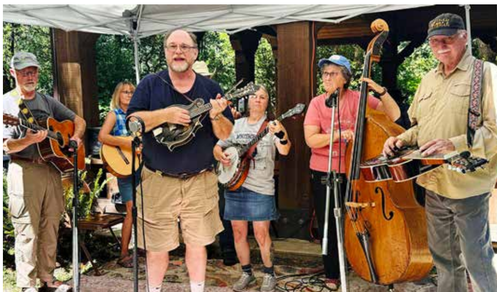
District 10 playing at the Eagleview Pickout on July 4-6