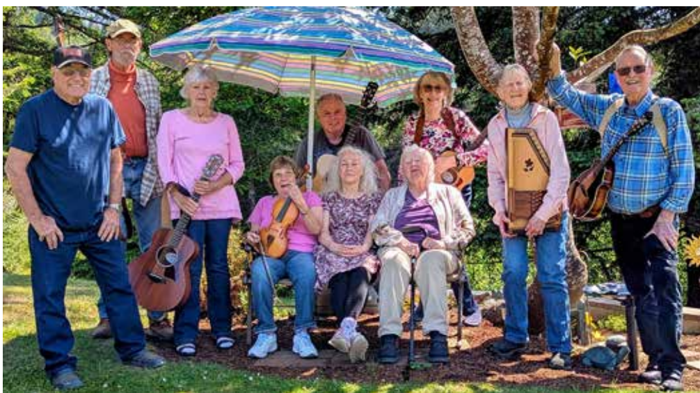
District 5 Family Portrait

the meeting, there will be a lunch hour of snacks and finger foods provided by our talented District members. After lunch, we will adjourn to the big room and give our monthly performance jam to all who gather to hear us from 1:00 until 3:00 pm. Y'all come!