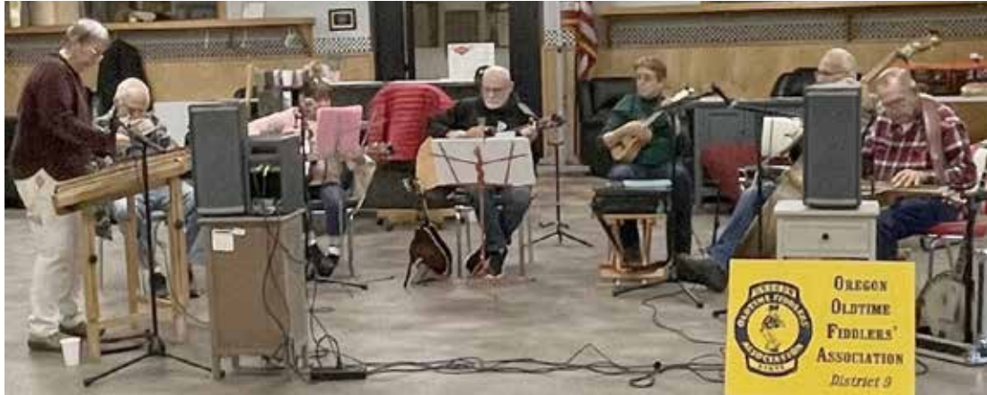
District 9 musicians at Sunday jam, January 11