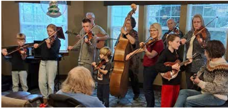
District 10 at Oak Park