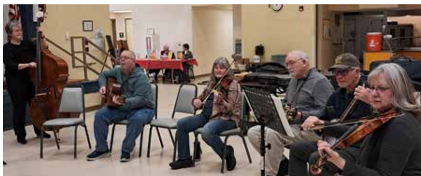
OOTFA Members from around the state enjoy a circle jam