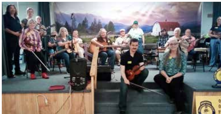
District 4 ready to play at the Roxy Ann Grange