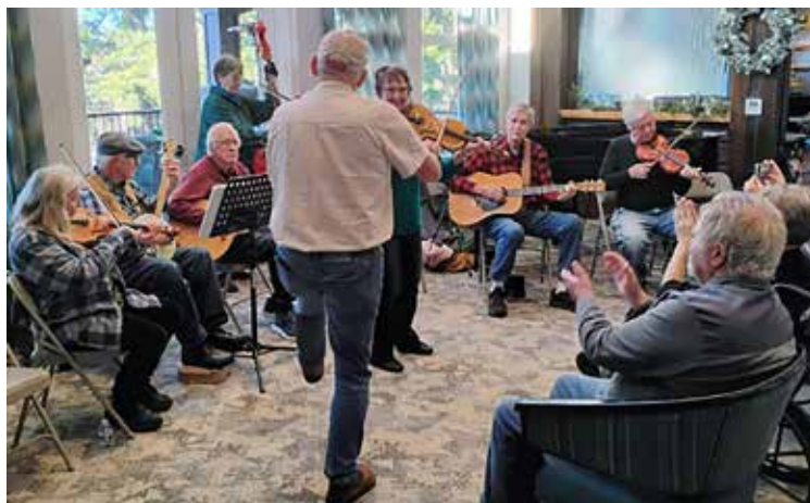
District 7 & 8 members at Morning Star Assisted Living, Beaverton