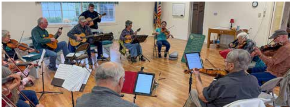
Intermediate Fiddle Class at Santa Clara Grange, second Saturdays