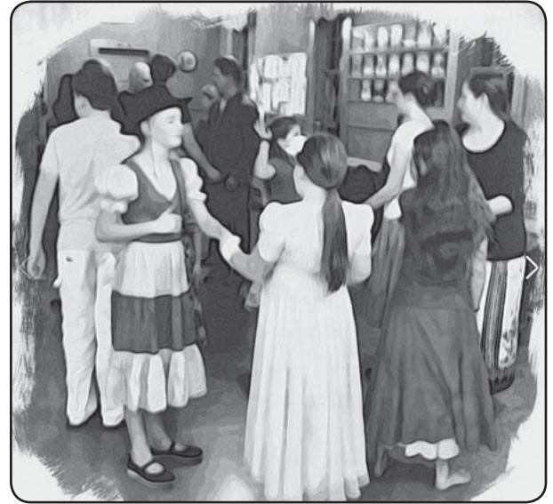
Dancers at the Spencer Creek Grange barn dance.