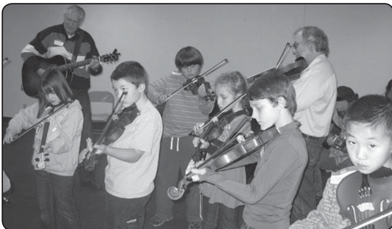
District 4 junior fiddlers sound off!