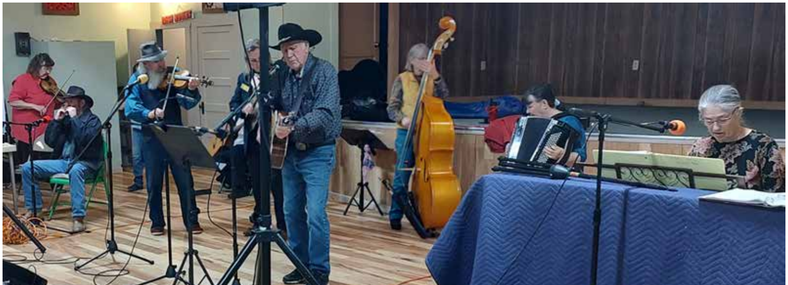
District 3 performs for music lovers and dancers each fourth Sunday at the Terrabonne Grange

Q: How can you tell the difference between old-time fiddle tunes? A: By their name.