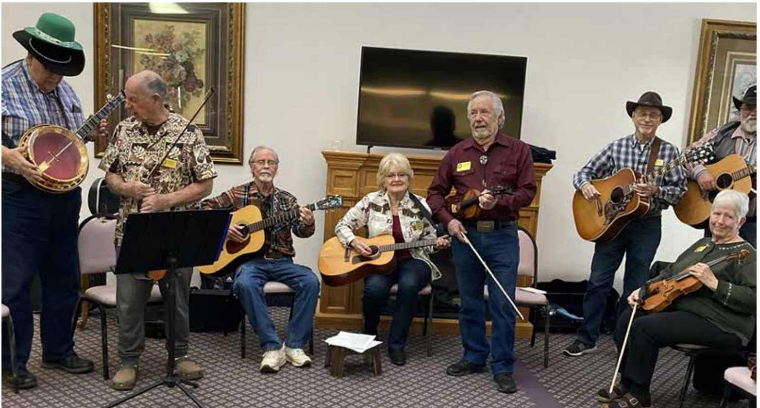
A small group of District 4 musicians played for the residents at Rogue Valley Retirement Center