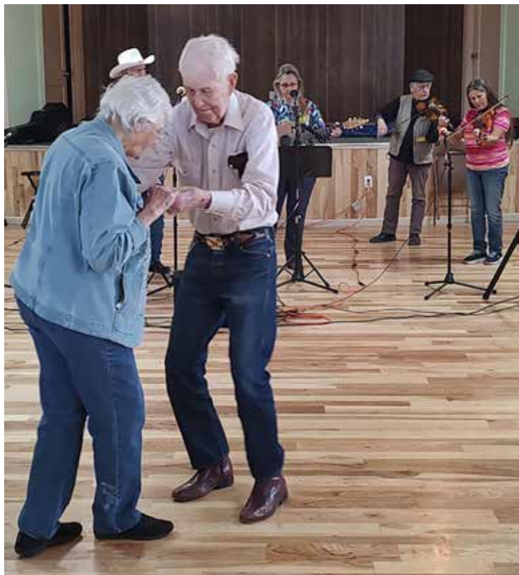
A couple takes to the dance floor at Terrebonne Grange

District 4 musicians finished the month of May with their monthly meeting and jam at the Roxy Ann Grange in Medford and the jam was well attended by musicians and audience. They dived right into the June calendar with a 2 hour performance at the Gold Dust Days festival in Gold Hill, Oregon. About 10 musicians played the old-time tunes under the oak trees in the garden next to the local museum. Young ladies dressed in costumes worn in the era of the gold rush wandered through the garden and performed a lively Virginia Reel for the audience. Later in the month a group of District 4 musicians entertained a charming group of residents with a performance of the old-time tunes at the Rogue Valley Retirement Center in Grants Pass.