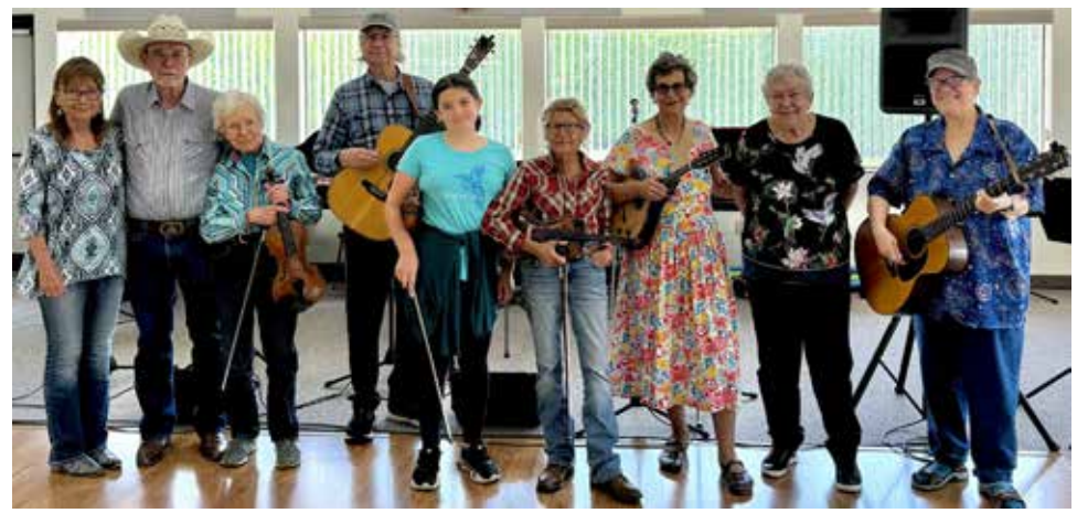
District 6 performed for a dance at the Lakeridge Community Center